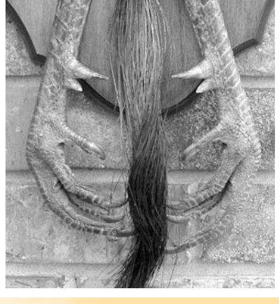
This double-spurred gobbler was harvested during the 2000 turkey season in Copiah County.

out spurs look similar to that of a hen, although they are larger in size. Another abnormality is