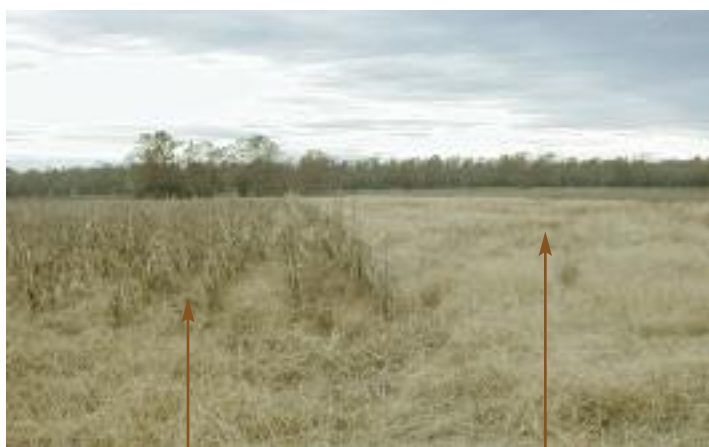
Unharvested Corn and Grasses