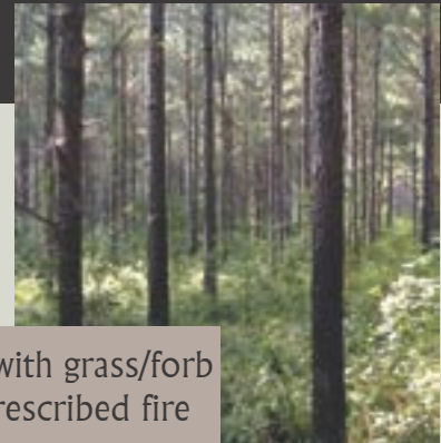
Thinned pine stand with grass/forb understory after prescribed fire

other wildlife. In the absence of soil disturbance, the plant community composition changes over several years, and annual plants are replaced by perennial forbs and grasses and eventually, woody plants. This change in plant communities is called succession. By planning soil disturbances on a 2- to 3-year rotation, you can manage succession and develop a complex of different habitats that meet the seasonal habitat requirements of a number of wildlife species. For example, first-year burn areas typically produce good quail brood cover, whereas second- and third-year burn areas provide better nesting cover. A rotational burning plan can be developed by creating 60-acre or smaller burn units and burning half to a third of these units one year, another half to a third the next year, and so on. Thus, a given unit is only burned every 2-3 years, but some portion of the property is burned each year. A rotational disking plan can be developed similarly. Disk a half to a third of suitable area each year in a rotational fashion so that all suitable areas are disked every 2-3 years.