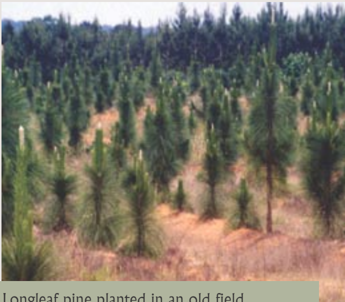
Longleaf pine planted in an old field

sensitive to competition with invasive, non-native grasses. Eradication of these grasses will significantly improve longleaf seedling survival. Non-native grasses should be eradicated with an appropriate herbicide treatment, but the appropriate treatment differs depending on which non-native grass or grasses are present. Consult with your forester to develop an appropriate herbicide prescription for pine establishment in former agricultural fields. Once invasive grasses are controlled, these sites can be managed as recommended for forest regeneration sites. Wildlife habitat in these old field pine plantings may be further enhanced by planting native grasses and forbs between seedling rows after non-native grasses have been eliminated.