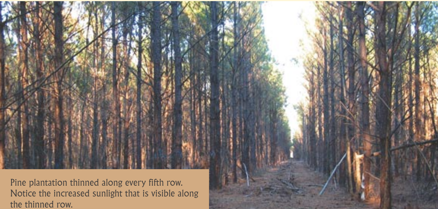
Pine plantation thinned along every fifth row. Notice the increased sunlight that is visible along the thinned row.

timber production, a basal area as low as 30 ft 2 /acre will produce optimal habitat. It may be desirable to thin less heavily during the first thinning, as trees may be more vulnerable to ice or wind damage. Subsequent thins can then be used to reduce basal area to 60 ft 2 /acre or less. Periodic thins will be necessary to maintain lower basal areas as trees continue to grow after each thinning. Individual landowner objectives will vary, so consultation with a registered forester and a wildlife biologist can help you find the best balance that meets both your wildlife and timber objectives.