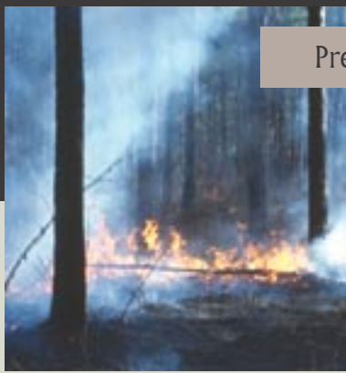
Prescribed fire in pine

Just as thinning stimulates growth of grasses and forbs, it also releases understory hardwood brush and trees that will shade out desirable grasses and forbs if left unmanaged. Some form of periodic disturbance will be necessary to control brush invasion. Prescribed fire and disking are two disturbance tools. When fuel conditions are appropriate for burning, thinned pine stands should be prescribe-burned during winter to early-spring. Prescribed burning should always be conducted by a certified prescribed burn manager, who will develop a written burn plan and obtain appropriate permits before burning. Check with your county Mississippi Forestry Commission office for more information about prescribed burning regulations. If prescribed fire is not an option, light disking between thinned trees during fall or winter is an alternative for relatively clean sites. Always be especially cautious when disking in woodlands to avoid damaging tree trunks and roots and to avoid personal injury or equipment damage. Soil disturbance, such as prescribed fire or disking, enhances habitat quality for quail and other grassland birds because it inhibits woody brush growth, promotes favored seed producing plants, reduces plant residue, increases bare ground, and increases insect abundance. The plant communities that develop following fire or disking also provide highly nutritious forage for deer, rabbits, turkeys, and