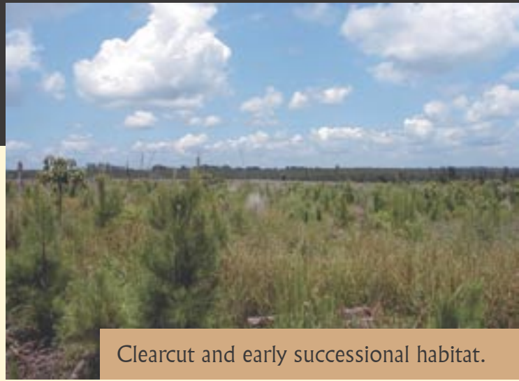
Clearcut and early successional habitat.

Increasingly, herbicides are an important component of site preparation. Selective hardwood herbicides, like imazapyr, can increase pine growth and survival and inhibit development of a dense brush layer, thereby increasing the window of grass/forb plant communities early in the rotation. Use of herbicides for herbaceous control after planting should be restricted to banded applications along the tree rows. When regenerating a harvested stand with loblolly, slash, or longleaf pine seedlings, replant trees on an 8- by 10-foot spacing if quail and other grassland wildlife habitat is your objective. Planting trees on a wider spacing allows maintenance of grassland habitat for a greater period of time before canopy closure of plantations. Rotational disking between planted rows in relatively clean sites can be utilized during the first few years after planting to maintain grassland habitat structure. Always be especially cautious when disking in