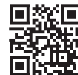
Scan to view maps and data about Upper Sardis WMA.