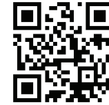
Scan to view location of Chickasaw WMA Headquarters.