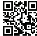
Scan to view location of Calhoun County WMA Headquarters.