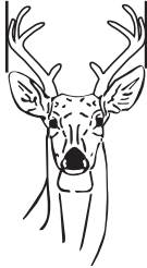
12" Inside Spread