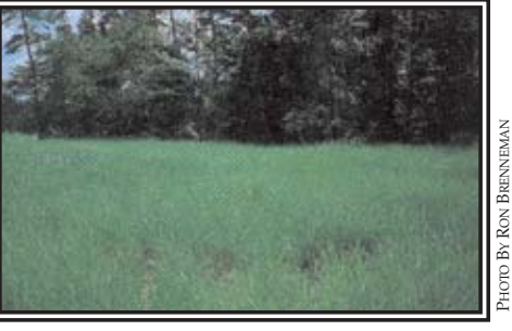
Wildlife does not feed on the lush chufa foliage.

Turkey Gold® Chufa (chêw-fa) is one of the most popular crops planted for wild turkeys. Turkeys will readily come to a chufa patch and continue using it for several months. If you want to attract and keep turkeys on you land, chufa should be a part of your habitat management plan. Chufa,