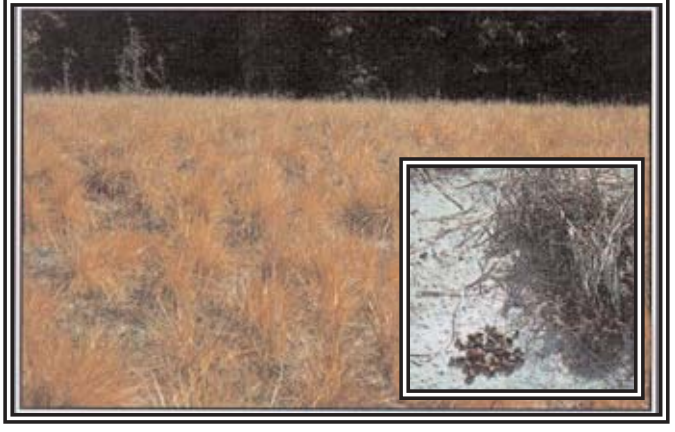
When chufa plants turn brown, turkeys begin scratching for the tubers. Inset: Chufa tubers grow underground at the base of the plant.

secutive frost-free days.. As it matures, the tops will turn a golden brown color. After the tops have turned brown, the turkeys will begin scratching the chufa tubers out of the ground.