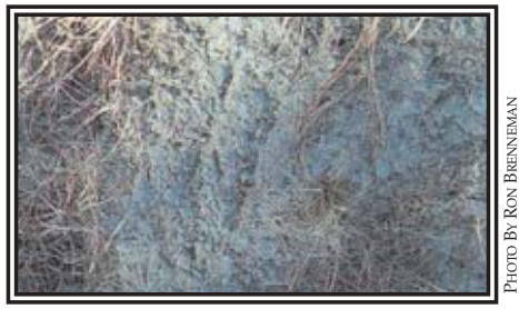
Turkeys scratch the tubers out of the ground.

during the winter. Once turkeys begin using chufa, they will visit the field regularly until the tubers are gone or spring greenup provides a more desirable food source. A chufa patch that is being used regularly by turkeys looks like a herd of hogs has been rooting in the field or takes on the appearance of craters on the moon.