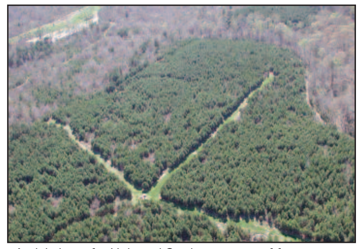
Aerial view of a Hub and Spokes system of forest openings.