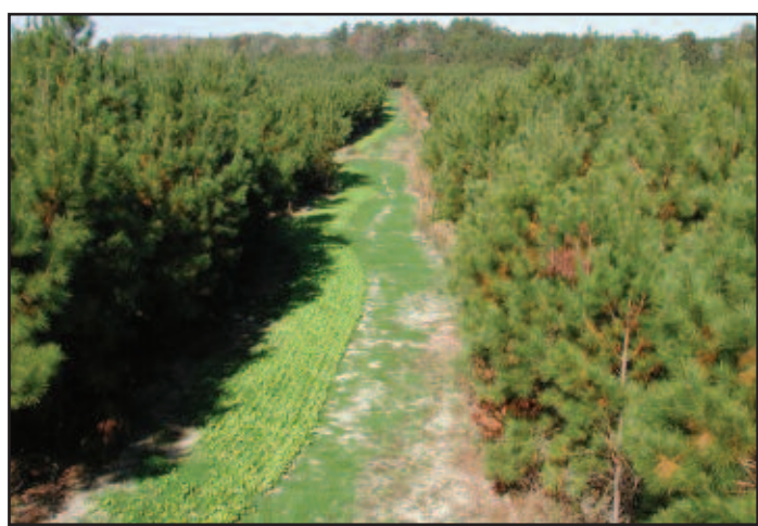
View of a "spoke" managed for deer forage production.