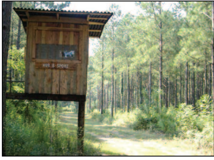
Shooting/viewing house placed at the "hub".