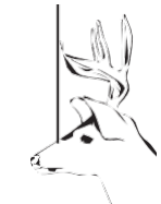
15" Main Beam

*Due to body size differences in the Delta Unit, ear-tip to ear-tip measurements are slightly larger compared to the other units.