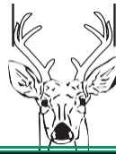
10" Inside Spread

To estimate a 13 inch main beam, the buck's head must be observed from the side. If the tip of the main beam extends to the front of the eye, main beam length is approximately 13 inches.