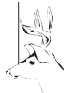
15" Main Beam

*Due to body size differences in the Delta Unit, ear-tip to ear-tip measurements are slightly larger compared to the other units.