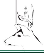
13" Main Beam

To estimate a 13 inch main beam, the buck's head must be observed from the side. If the tip of the main beam extends to the front of the eye, main beam length is approximately 13 inches.